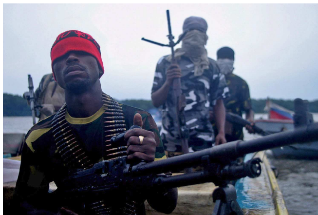
Militants from the Movement for the Emancipation of the Niger Delta (MEND) patrolling the volatile oil rich creeks of the Niger delta

have been the source of much dispute and conflict. For example, Niger Delta states have argued that they should receive more than the current 13% of the revenues through derivation. On the other hand, the non oil-producing and more populous states (especially in the north) argue that Nigeria's oil resources should benefit the entire country and that the principle of need should be the most important.